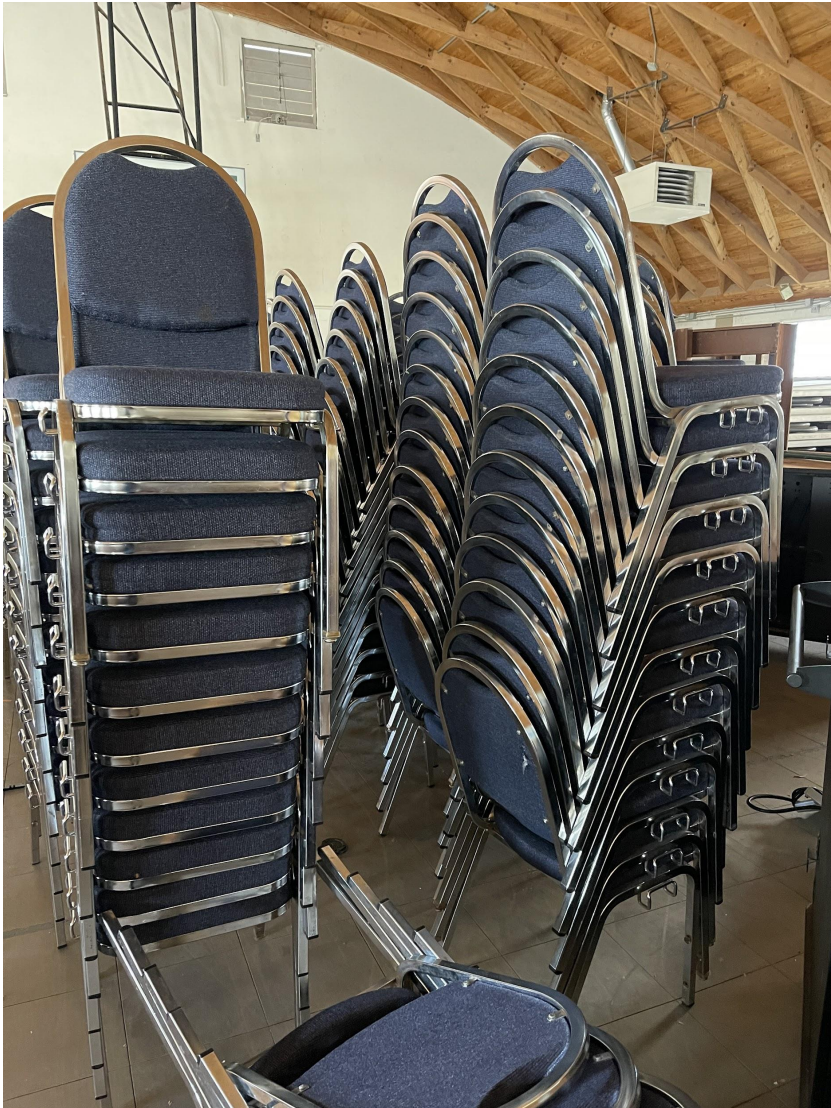
100 Padded Chairs