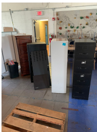
File cabinets (3)