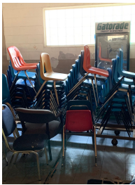
Bulk classroom chairs (old stage area)