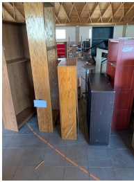
Wooden bookshelves (10)