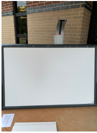
Promethean Activboard (1)