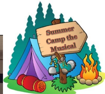
“Summer Camp – the Musical” Evening Performance