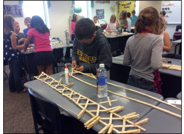
Bridge engineering in “Science in Action”