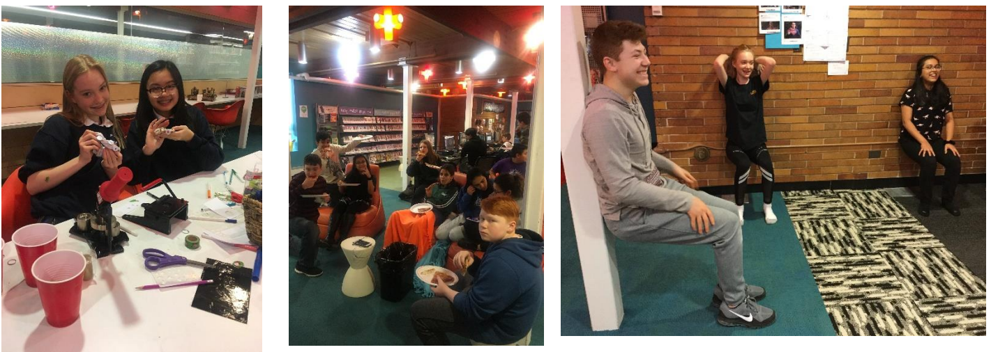
Teens enjoying button making, Movies in Teen Underground, and a Sit Wall Challenge

We hosted 11 Niles West students who spent a Saturday morning 'Giving Back'. They helped clean and organize Teen Underground and assisted with pulling YA materials like books and DVDs listed on a report.