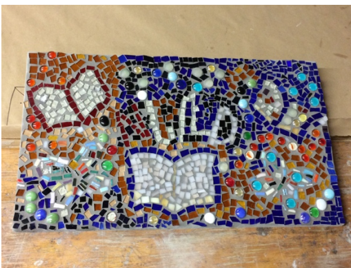
One of several mosaics created by participants