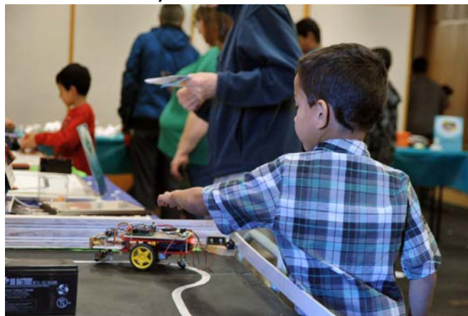
A child experimenting with the robotics station