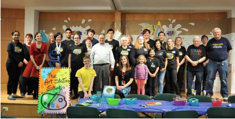
Staff and volunteers get ready for MakerFest

Patron Facebook comment: Today 12-4-16 was a wonderful day at the library. The awesome staff and crew were so genuinely kind and happy. My family and I were greeted with cookies and apple juice, then had our Christmas Picture taken. Shout out to the photography crew! Very proud to see how libraries are still a form of finding sanctuary. Merry Christmas and a prosperous New Year!! Cheers!