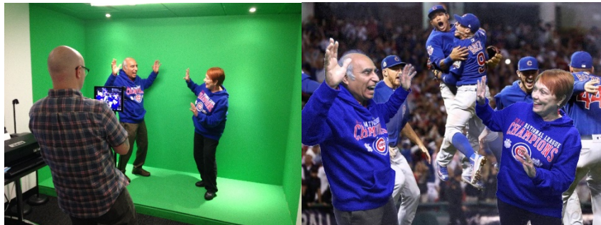
Waiting for their turn at the Cubs-themed green screen, and then posing to show their excitement