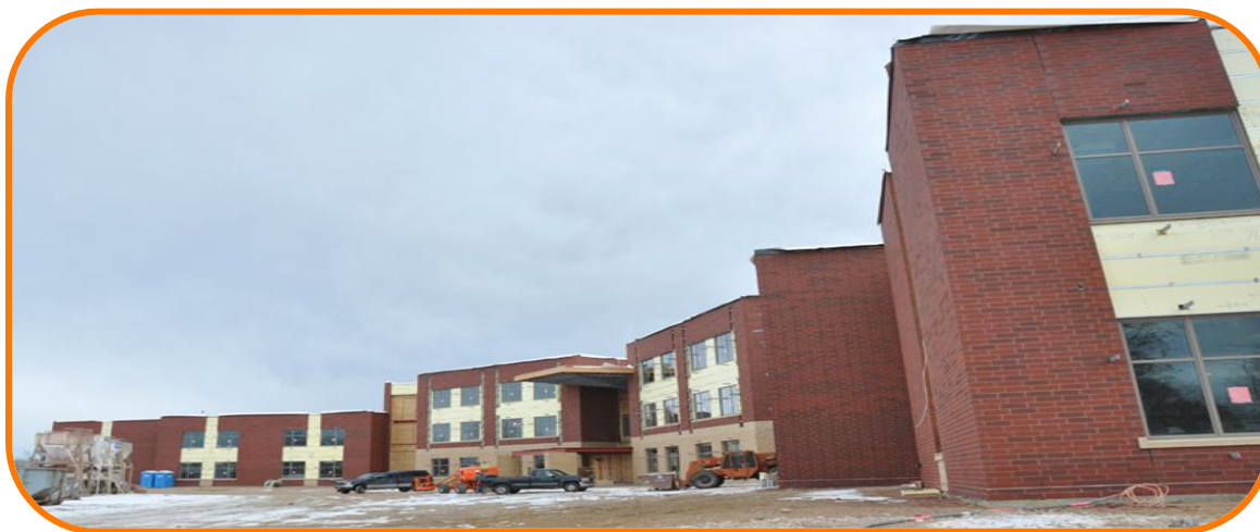
District 287 | North Education Center