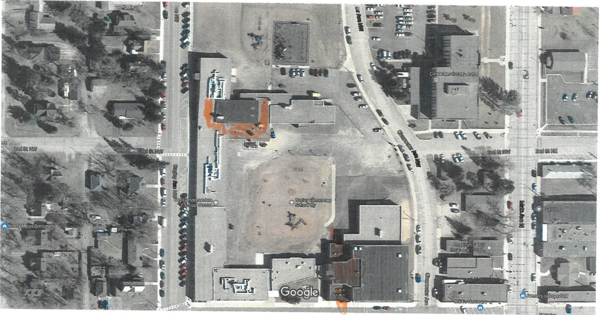
50 ft