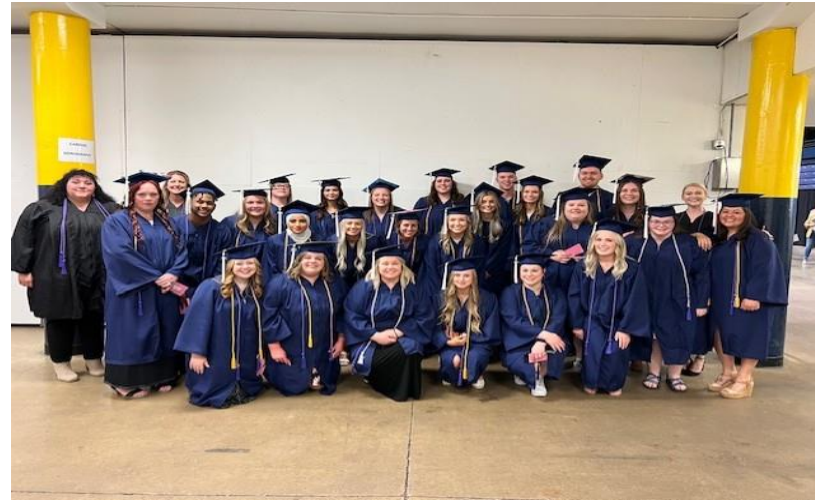
Class of 2023