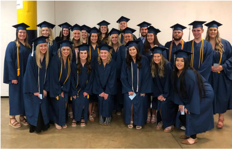
Class of 2022