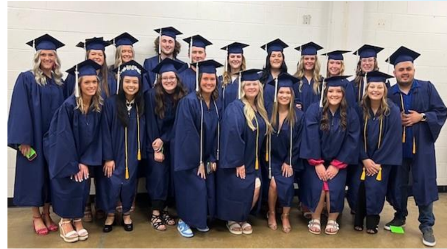
Class of 2024