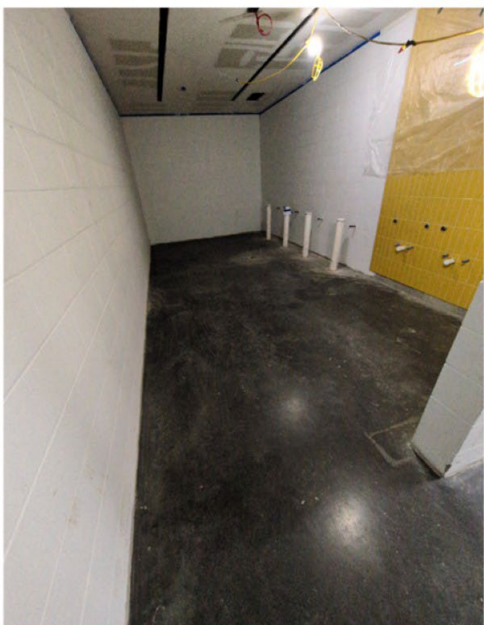
Finish Work in Restroom Areas