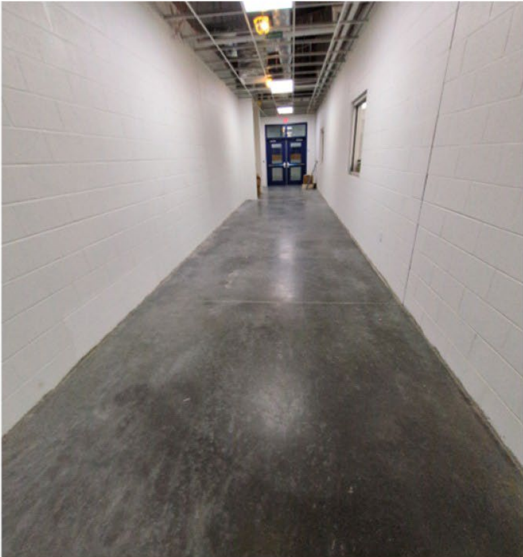
Corridors in Area A with Ceiling Grid and Light Fixtures