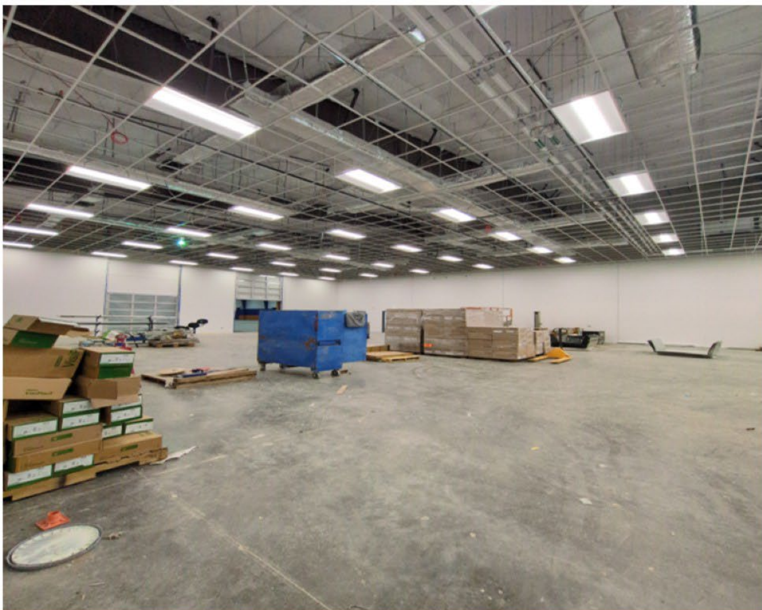
Gym Area, With Ceiling Grids and Light Fixtures Installed