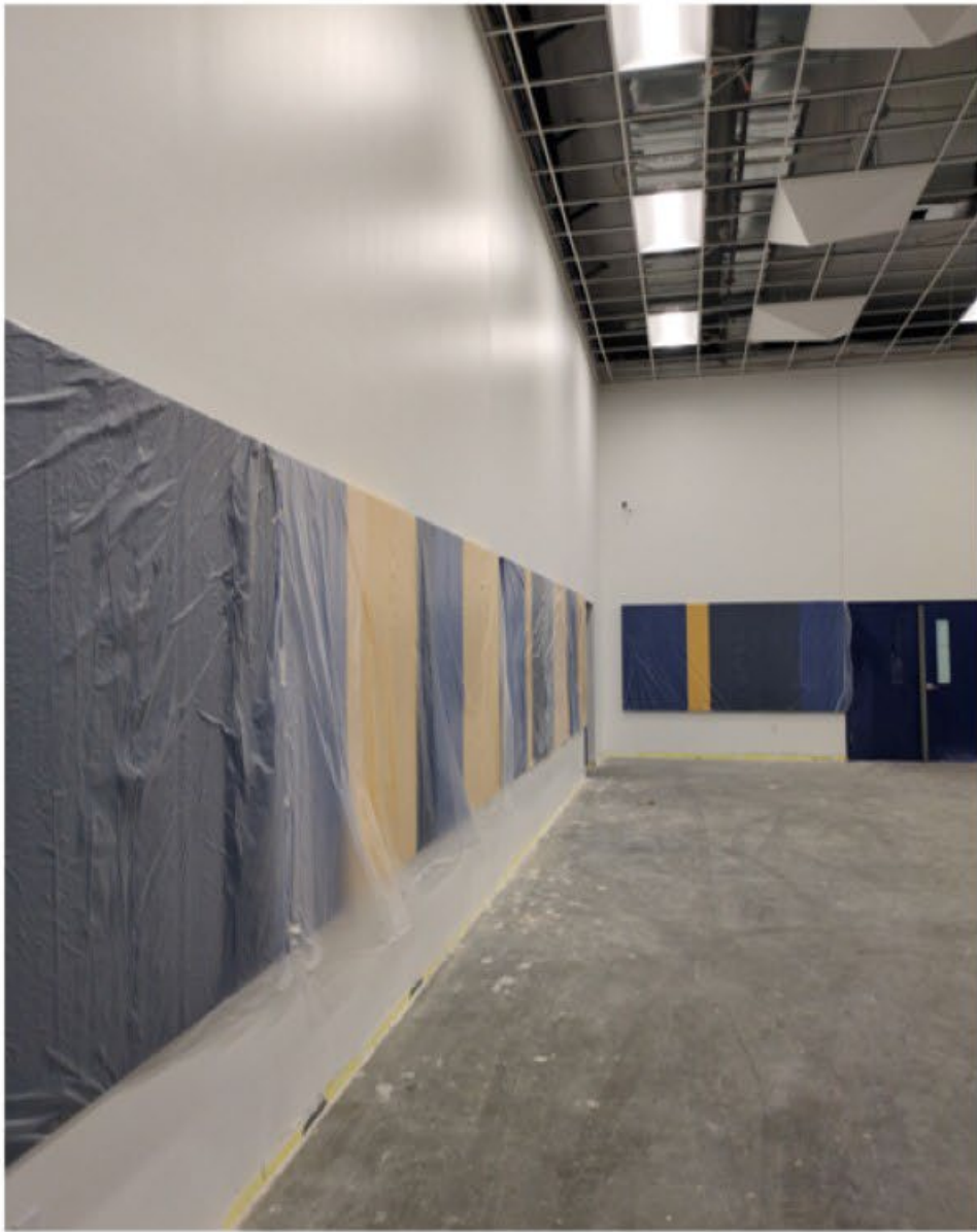
Acoustic Wall Panels Installed