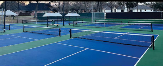
HOLLY TREE COUNTRY CLUB, TYLER TEXAS

PRO TECH PROVIDES TOP QUALITY SURFACES, TENNIS-TO-PICKLEBALL CONVERSIONS, CONSTRUCTION, AND RENOVATION.