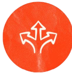
Differentiate Curriculum Materials