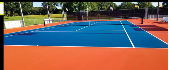
UNIVERSITY OF TEXAS AT TYLER

WE OFFER FULL TURN-KEY POST-TENSION COURT CONSTRUCTION, POST-TENSION CAPS, RESURFACING, REPAIR AND MORE.