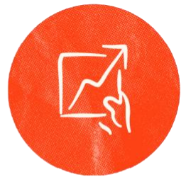
Drive Measurable School Improvement

Our team of passionate, mission-driven experts brings years of experience in change management, district strategy, leadership, professional learning, and curriculum development. We are committed to improving outcomes for all and keeping impact and results at the heart of everything we do. Through our strategic guidance, systemic change management, and personalized action plans, we help your district build resilience, sustain growth, and achieve long-term success.