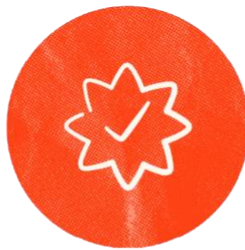
Deliver Exceptional Instruction