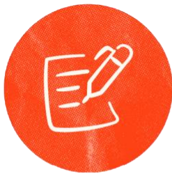
Develop Strategic Direction

Education Elements strengthens school systems to be the top-rated choice for high-quality educational experiences by creating the conditions for students, staff, and families to thrive. We are a team of K-12 practitioners who combine instructional expertise, research, and community perspectives to help school systems transform strategic priorities into tangible outcomes, so you can focus on what matters. We approach each partnership by sharing proven strategies and a deep understanding of your district's unique context. We honor the goals, priorities, and vision of every leader with whom we work, and we help them to hone, articulate, and make those visions a reality. By embedding research-based practices, measures of progress, and our deep expertise into our solutions, we help you achieve the following: