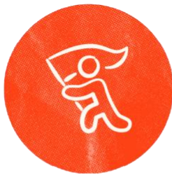
Grow School & District Leaders