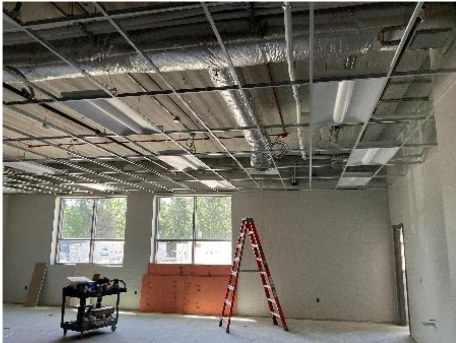
Ceiling Grid and Lighting