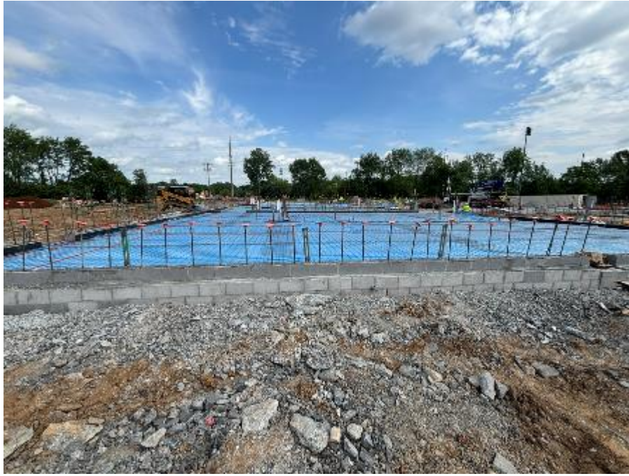
Concrete Slab Prep