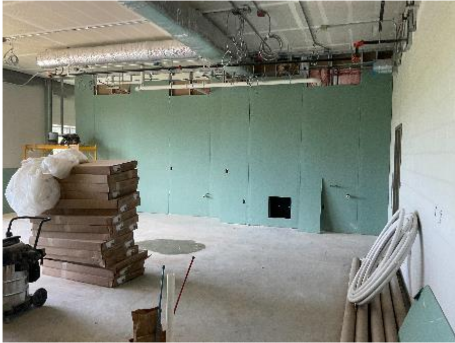
Third floor drywall installation