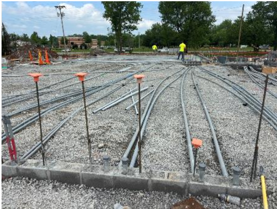
Under Slab Utilities