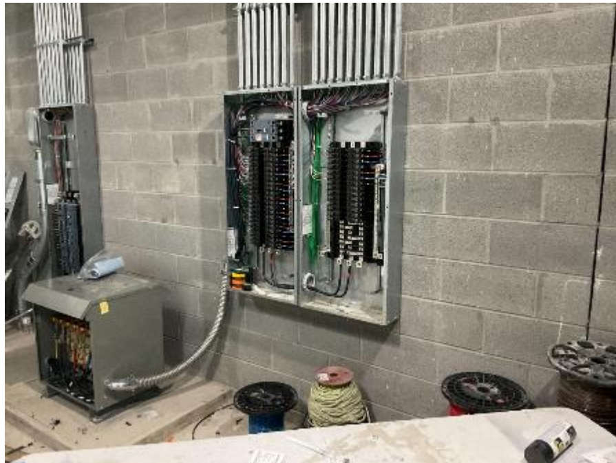
Electrical Panel Make up