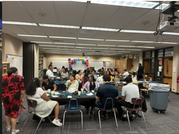
Bancroft Program Annual Celebration