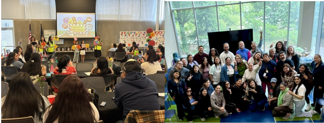
Parent Leadership Program final presentations