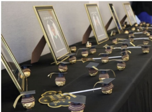
Evening Celebration: Preschool grads