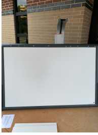
Promethean Activboard (1)