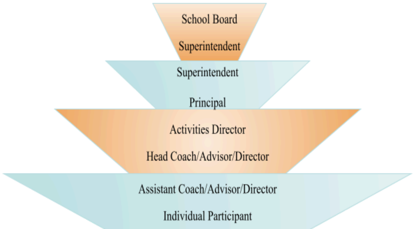
Figure SEQ Figure \* ARABIC 1- Win-E-Mac Chain of Command for Activities

The following table describes the relationships and responsibilities expected between the coach/advisor/director of an activity and the participants/parents/fans.