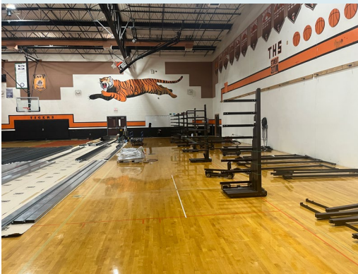
New bleachers were installed at Taft 7-12 and are already in use by the school!