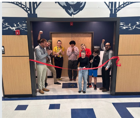
Students and staff celebrate the completion of the restroom remodel at Newport Middle School!