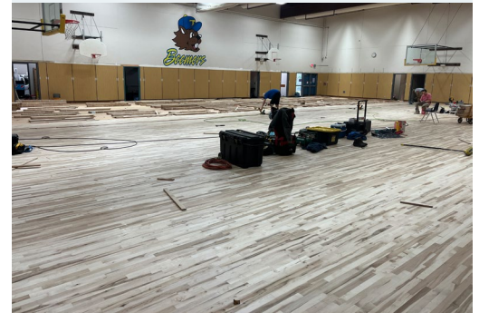
New flooring installation at the Toledo Elementary gym.