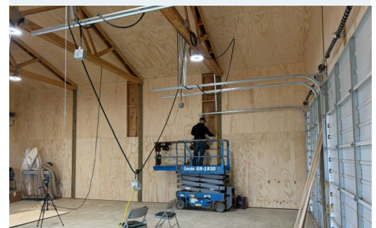
The new Forestry Program building at Waldport High School is now complete.