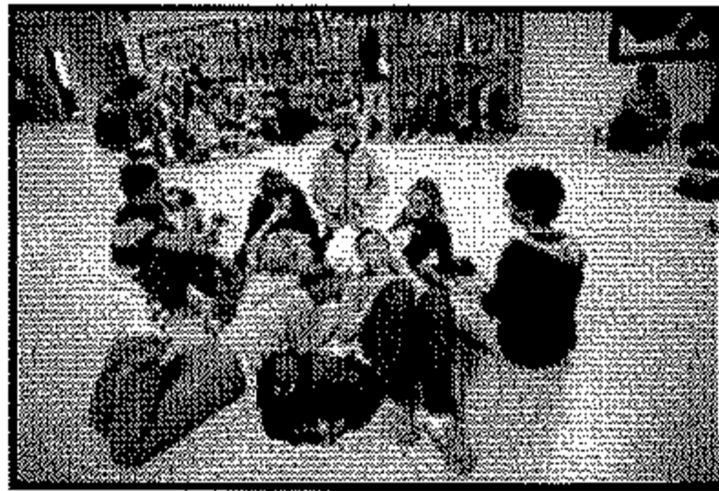
Lunch at Thomas Jefferson High School in suburban Washington, D.C.

There are more than 18,000 public high schools in the United States. What if you could take a snapshot of each one and capture, at a particular moment, what kinds of students were enrolled there and the caliber of the education provided them? If you were to collect these individual snapshots into one huge national yearbook, which high school would be chosen as "Most Likely to Succeed," meaning that it set the best example of how to prepare students to achieve their post-graduation goals?