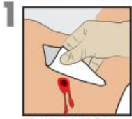
Wipe Wound with Gauze

(Intermediate & Advanced Kits) Apply HyFin® Chest Seal