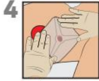
Firmly Press onto skin