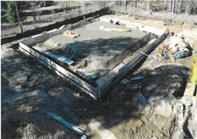
Formed Stem Walls