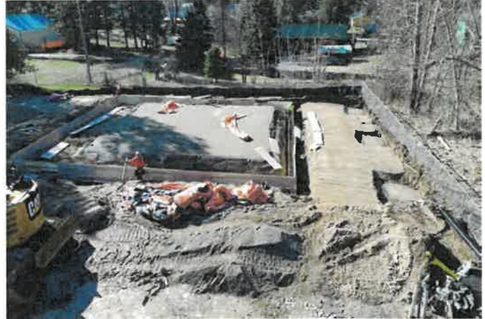
Formed Stem Walls