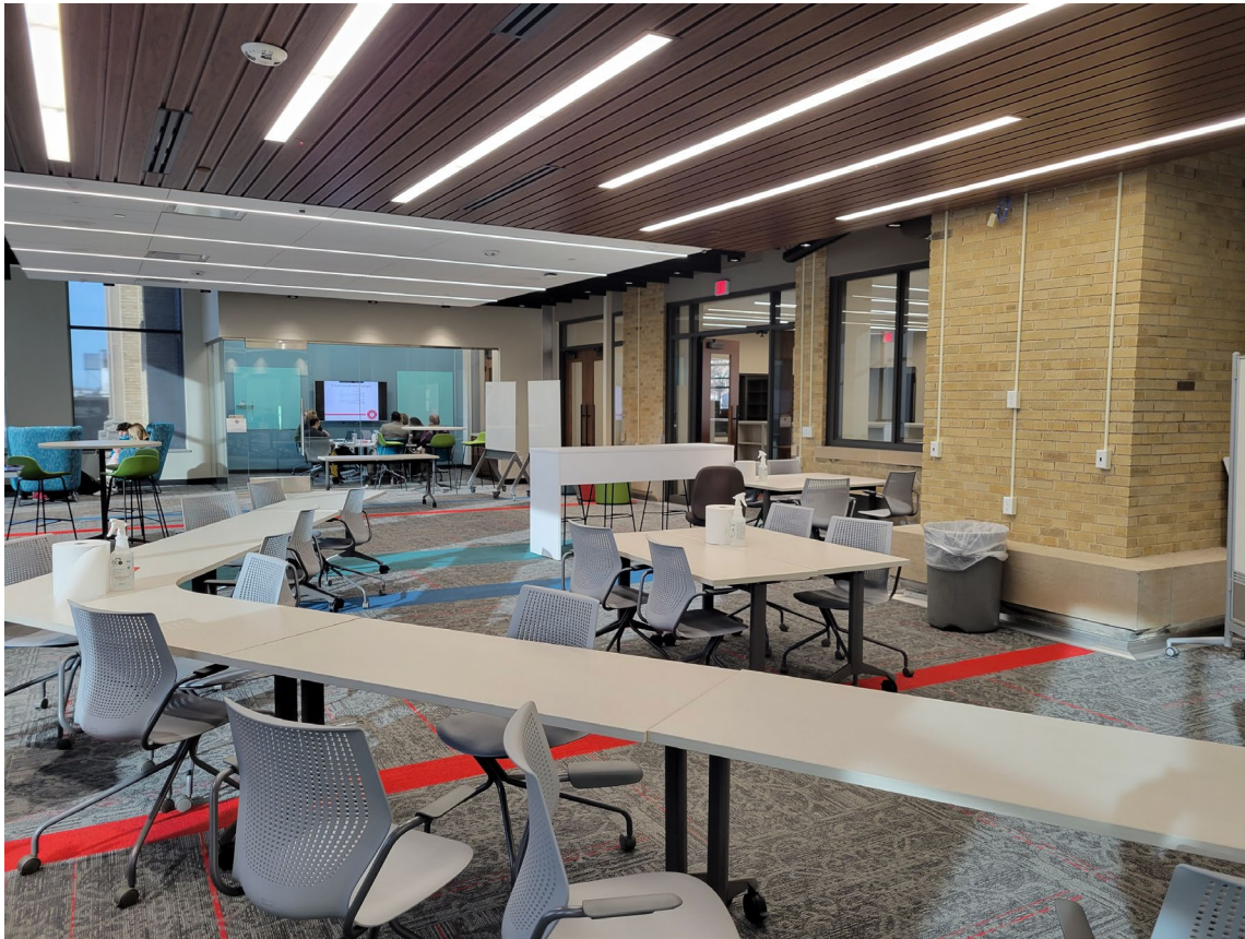
Renovated LMC space - now being used by students