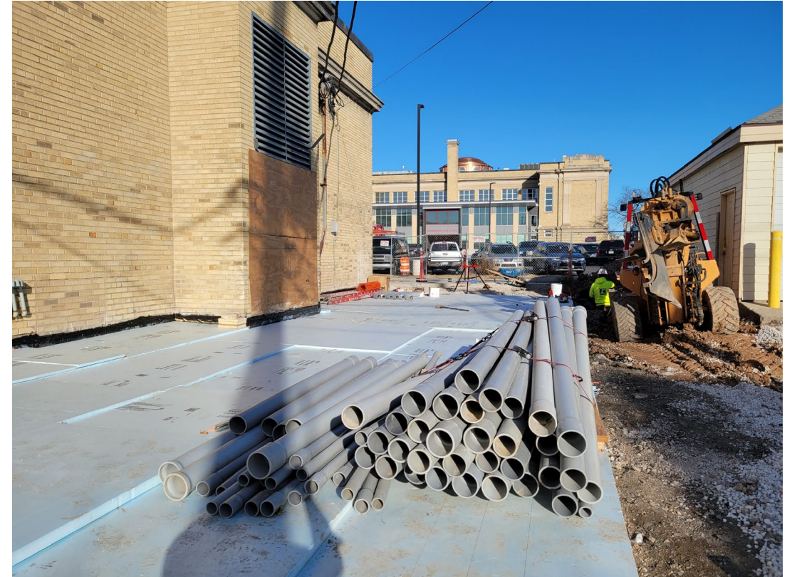
Utility work and waterproofing underway on the west end of the Powerhouse