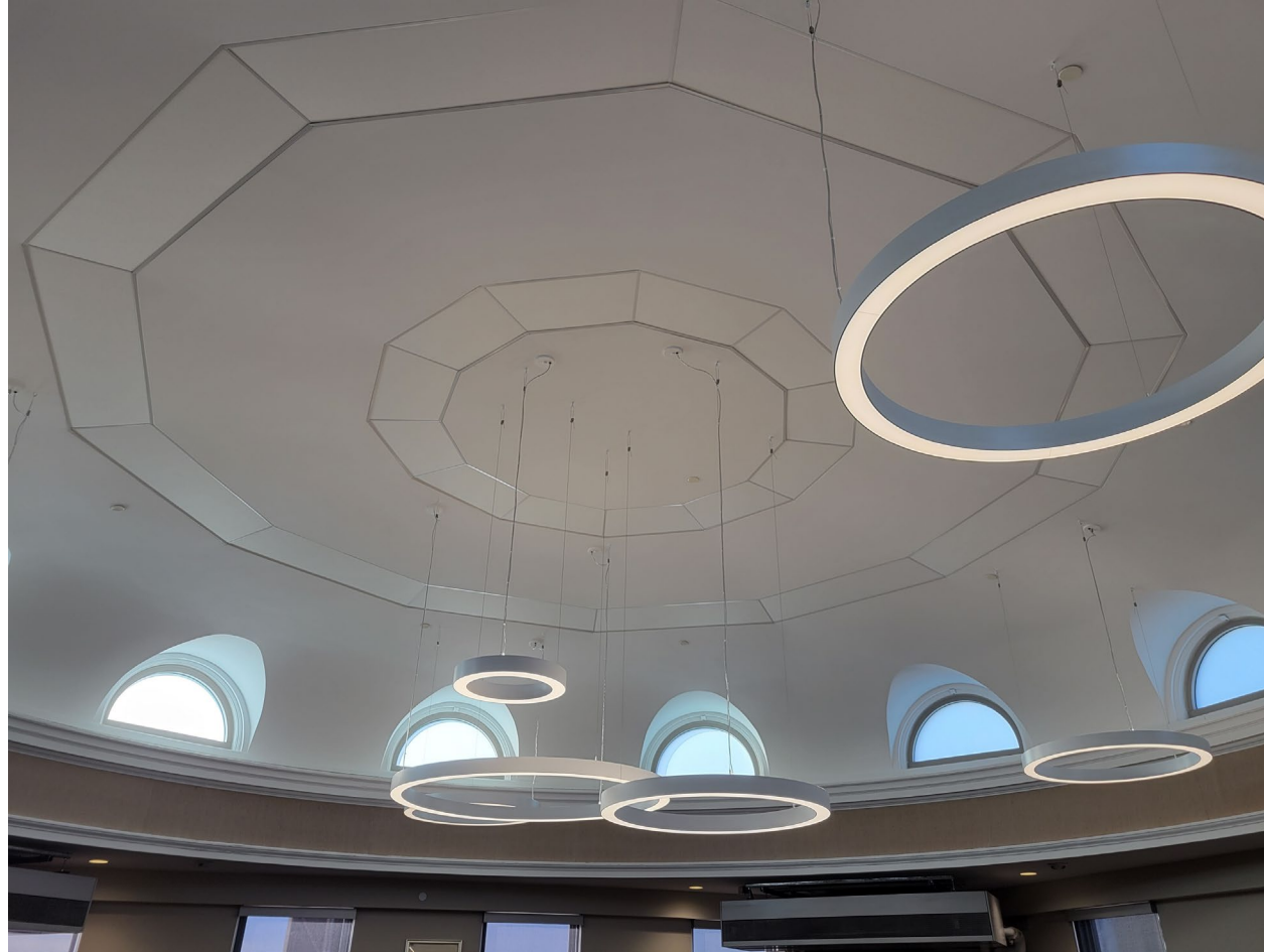
Renovations to the copper dome-interior