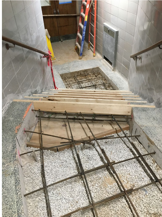
Stormwater piping repairs and floor/stair rebuild at lower level of Pool