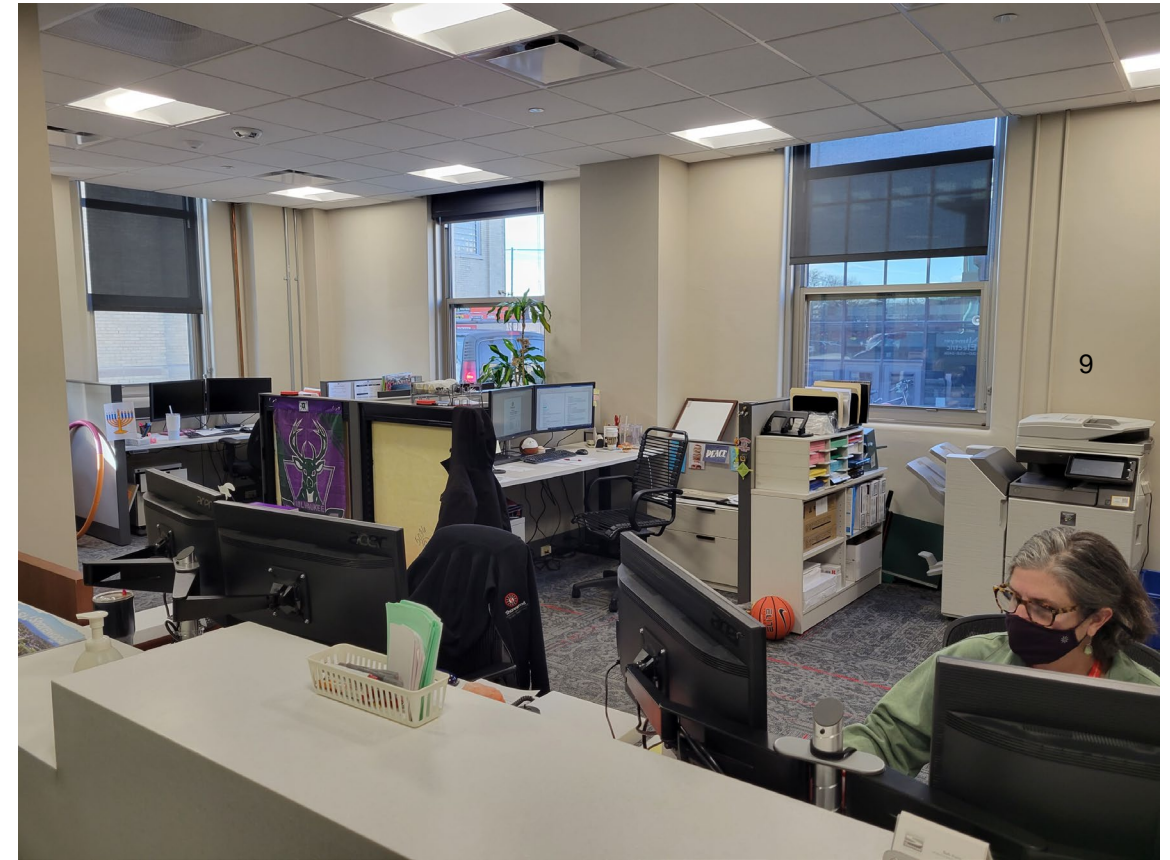
Newly renovated Recreation Department space