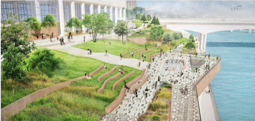
Park at RiversEdge ($20 million)