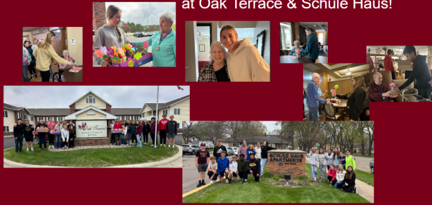
8th Grade WEB leaders delivering the May Day baskets at Oak Terrace & Schule Haus!