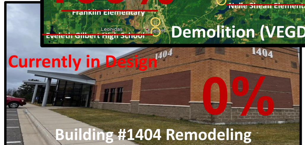
District Administration Building (DAB) Upgrades