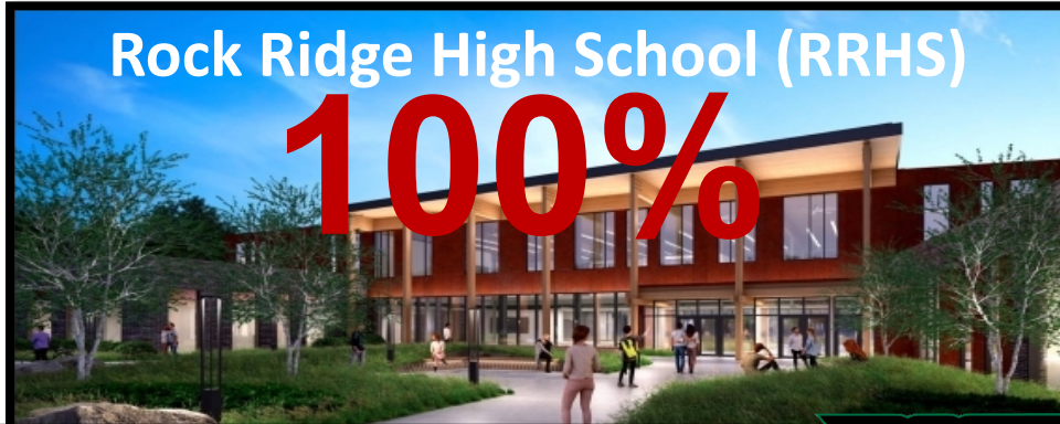
Rock Ridge High School (RRHS)