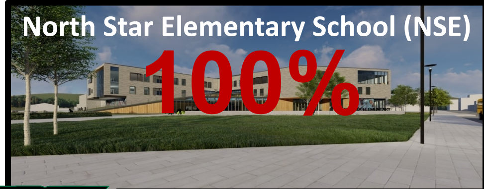
North Star Elementary School (NSE)