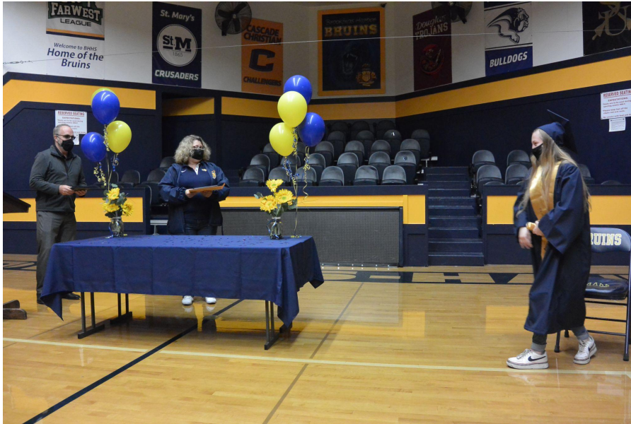
$1,000 SOWIB Scholarship