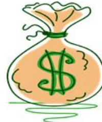
70 - Working Cash