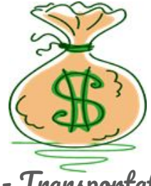
40 - Transportation