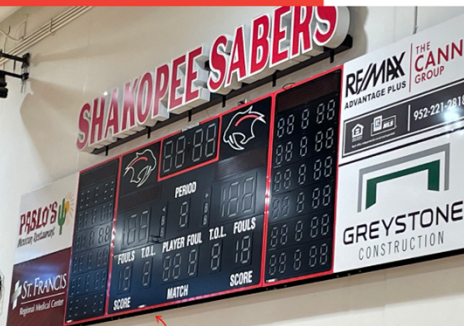
Competition Gym, Four-Panel