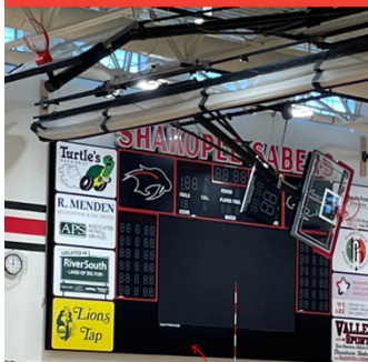
Competition Gym, Eight- Panel