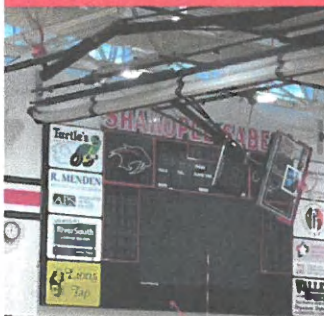
Competition Gym, Eight-Panel