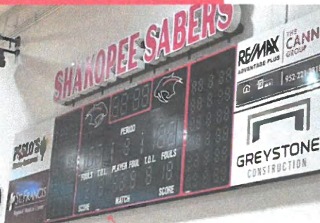
Competition Gym, Four-Panel