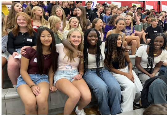
Ninth graders connect with each other in person (without screens) on the first day of school at Stillwater Area High School.

Educating and caring for students is at the heart of what we do. So when district leaders in Stillwater Area Public Schools noticed a rising trend in mental health issues among students, they took action. At the start of the 2025-26 school year, Stillwater schools implemented a series of districtwide changes focused on improving emotional wellbeing and academic outcomes for all 8,300 of its students.