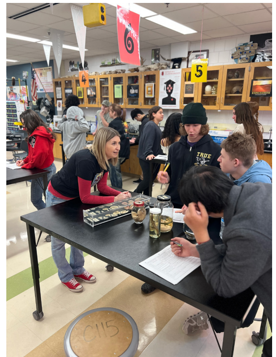
Stillwater Area High School students dive into a science lesson, showing the kind of focus and back-and-forth that's happening more often in phone-free classrooms.

Stillwater Area Public Schools will continue working with our community to ensure these efforts create healthier, more engaging learning environments, and fulfill our mission to “inspire curiosity and a love of learning in every child.”