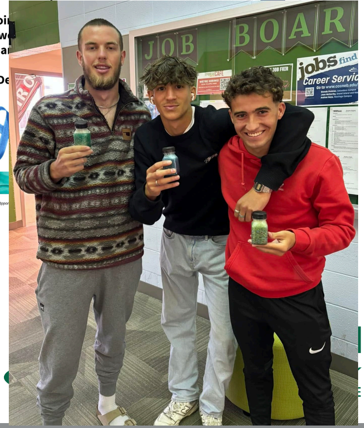
CCC is an Equal Opportunity Institution