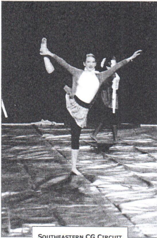
SOUTHEASTERN CG CIRCUIT

CG Field Days behind us ... and what a season it's going to be.... Now off to our 2 Drum Premier events... Greenv