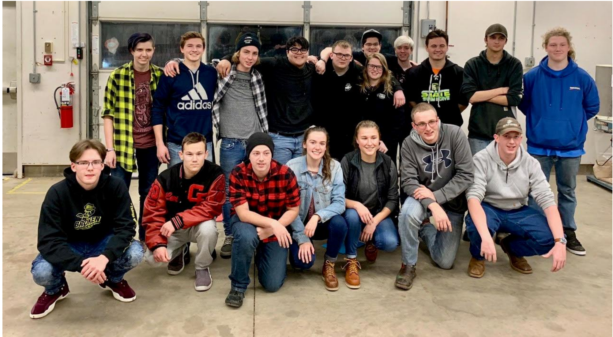
In 2018 Pilot Year - 11 out of 20 students are from Red Wing High