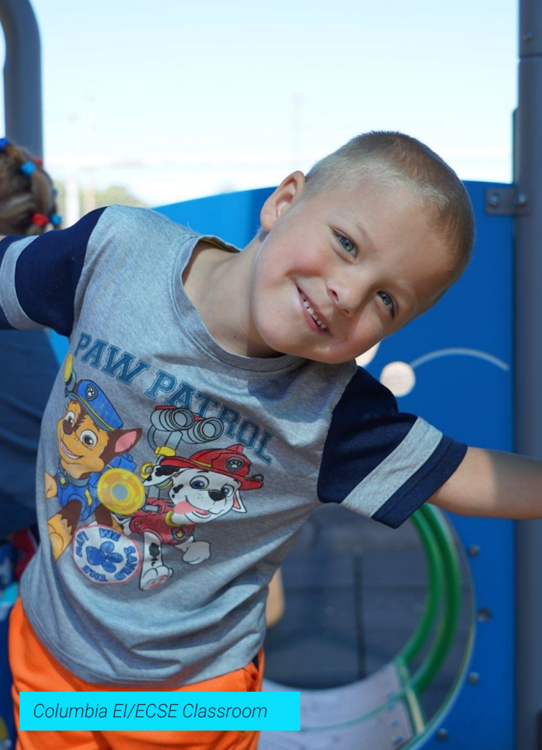
Columbia EI/ECSE Classroom