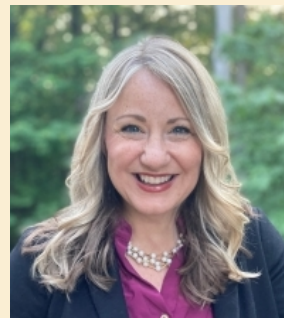
Mjere Simantel Social Services