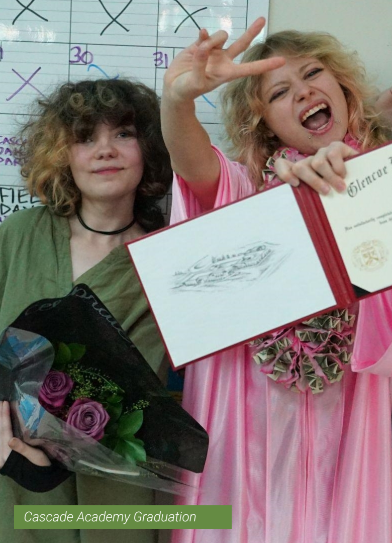
Cascade Academy Graduation