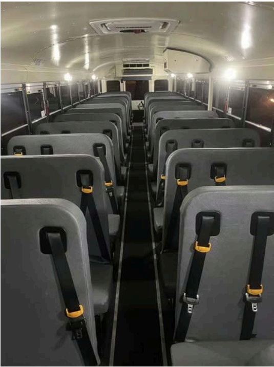
New Busses Delivered!