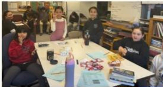
Battle Book team on State Battle day!