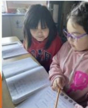
Students peer edit during writing