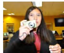
April 2023 BHS Happenings

Entrepreneurship is a course that acquaints students with the knowledge and skills necessary to start up and operate their own businesses. They cover topics such as human relations and psychology, financial planning, communication, marketing, and prototyping. The students take a product from idea to sales over the course of the semester.