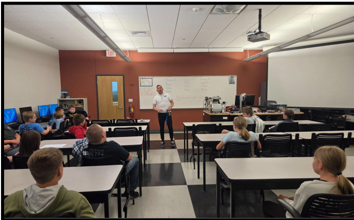
A college representative gave a really relatable presentation about continuing education options that might fit their needs.