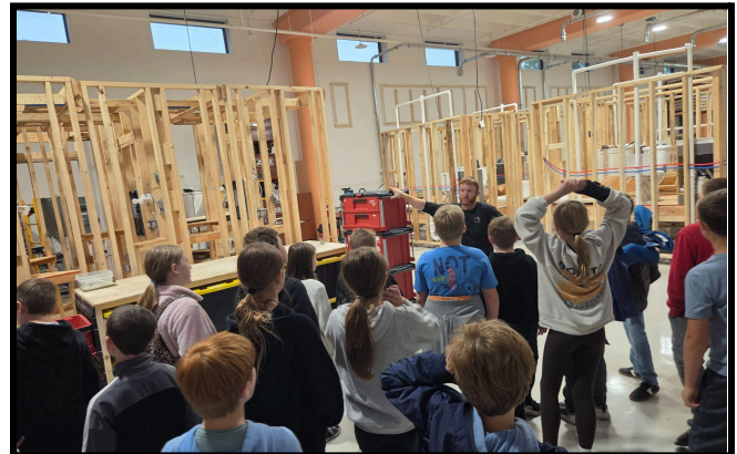
Students learned about the 1 and 2 year degree options available in Construction.