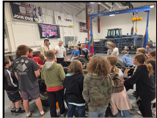
Students learned how to use the equipment to raise and lower the hood of a semi.