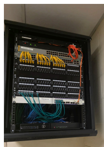
HJH Library After