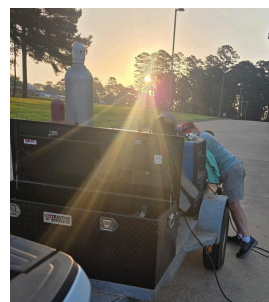
Car Rider Pro Welding