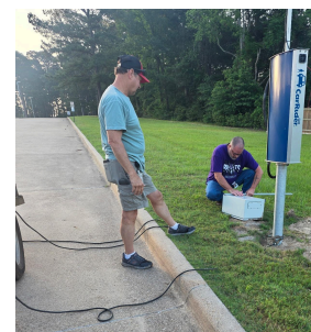
Car Rider Pro Installation