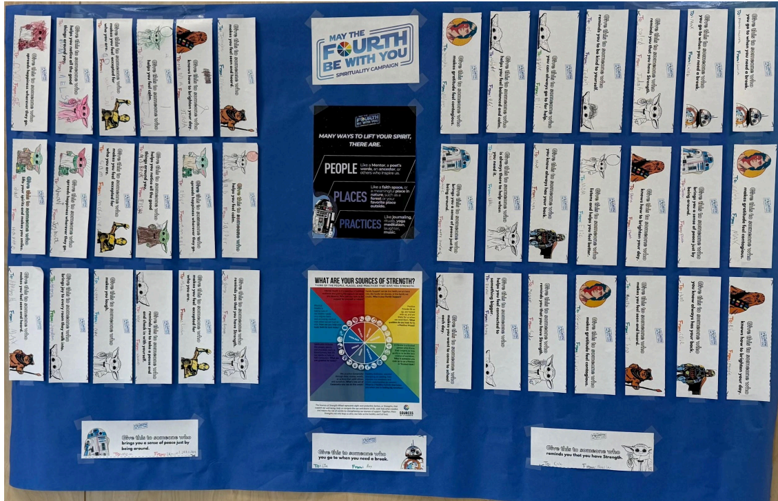
Campaign Credit: Tanalian School

We are looking forward to supporting our sites this fall with a more robust implementation of Sources of Strength and will be incorporating site-based Student Governments and District-Wide Student Government into this process as well in order to lean into the leadership development components of the program.