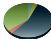
Incidents - Employee Injuries by Cause of Injury (Primary)

Struck By Strain or Sprain Injured by Student Cut, Puncture, Scrape Fall, Slip, or Trip