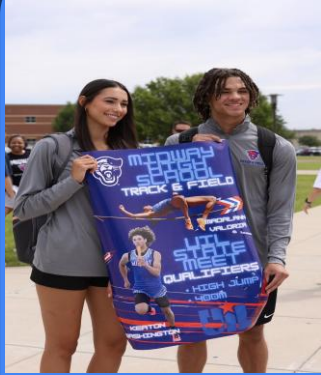
Track and Field