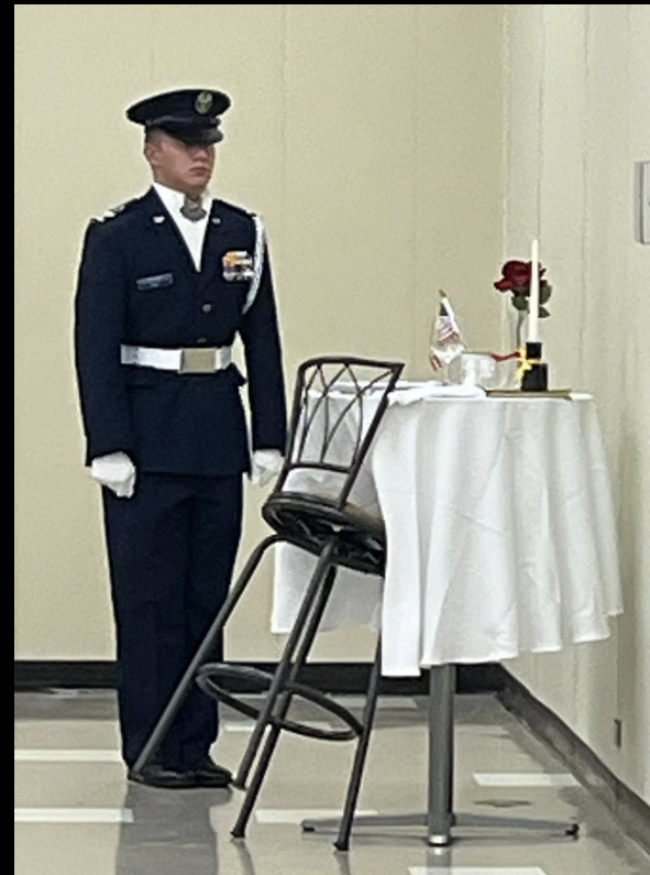
Annual Veterans' Day Dinner