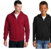
Full-Zip Hoodie Red or Black $30