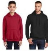
Pullover Hoodie Red or Black $25