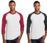
3/4 Sleeve Raglan Red or Black $20