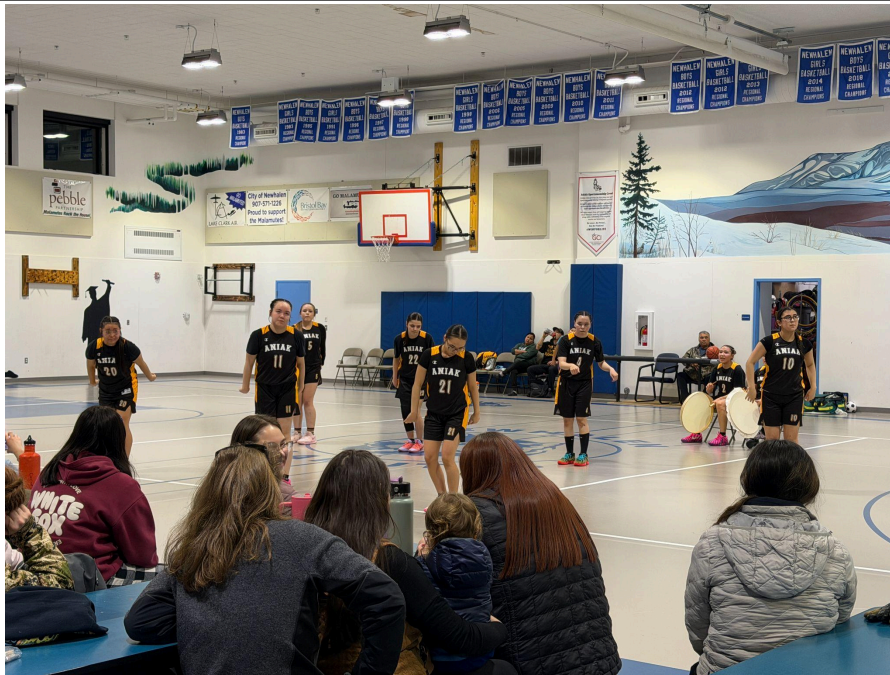
After a competitive game of basketball the Aniak girls basketball team performed traditional dances for the visitors.