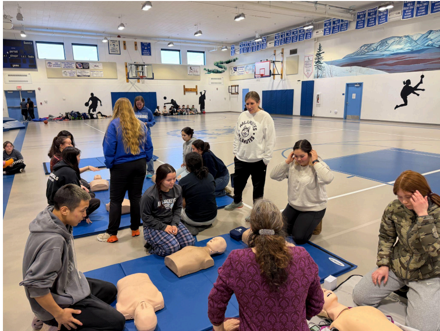
We had around 30 students earn a certificate through this training.