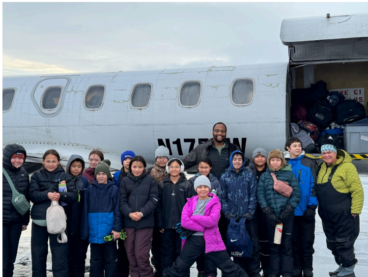
Newhalen Jr High teams getting ready to head up to Bethel to compete in the jr high tournament.