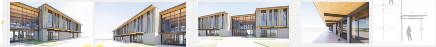
Canopy Study 3: Steel to edge of opening, 6" stud wall, 9' outrigger.