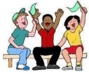
1 st Grade

exploring our five senses and weather. In math this month, we will be learning to write and recognize numbers 1-10 and we will slowly introduce addition and subtraction concepts. So much to learn and do! We are excited about our new math and science adoptions and we are ready to dive in!