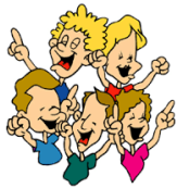
4 th Grade

In social studies, third graders are learning about community and what it means to be a good citizen. We will continue to strive for excellence in character and education!