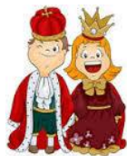
3 rd Grade

Second grade is back into the swing of things as we start another year. In math, we are using our addition and subtraction skills from first grade and even adding three digit numbers. In reading, we have just implemented our workstations so that our teachers can read with guided reading groups soon. We are also testing our students with TPRI and DRA. In language arts, we are studying subject and predicate. Science is bound to be fun as we discuss scientists and the tools they use. In writing, we are discussing writing resources and introducing our students to well written sentences. Social studies finds us discussing our country and citizenship.